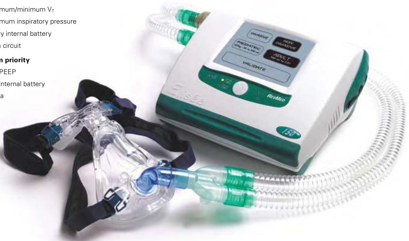
Elisée 150 can be used with ResMed non-vented masks for a comprehensive ventilation solution.